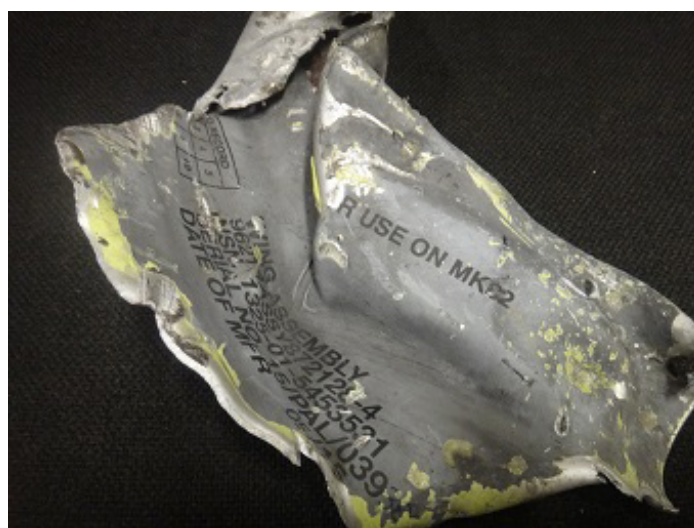
Remnant of a UK-made Paveway IV bomb found at the scene of the attack on Al-Muqbeli Warehouse. As the marking “FOR USE ON MK-82” indicates, a US-made Mk-82 warhead was used with the Paveway IV bomb. The marking “NSN1325-01-545351” is associated with the Paveway IV wing assembly. The marking “96214” identifies Raytheon as the manufacturer, and the marking “05/15” identifies the weapon’s date of manufacture as May 2015.