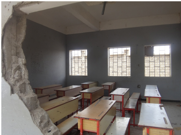
View of destroyed exterior of Asma'a bint Abi Bakr School in Al-Mansuriyah District, Hudaydah Governorate after August 2015 airstrike

of their own activities, but also expected to “seek to prevent or mitigate adverse human rights impacts that are directly linked to their operations, products or services by their business relationships...” 144 Each business is expected to put in place an ongoing due diligence process to identify, prevent, and mitigate adverse human rights impacts. 145 When a business identifies adverse human rights impacts connected to its activities, it is expected to take appropriate action, such as using its leverage to cease or mitigate the adverse impact 146 or ending its business relationship. 147 If a business finds that it has “caused or contributed to adverse impacts,” it is expected to provide for or cooperate in the remediation of these impacts. 148