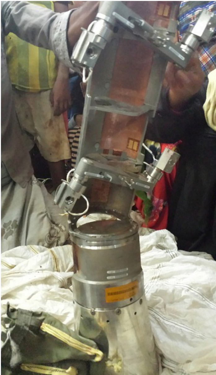
A stabilization unit of a BLU-108 submunition, recovered at the scene of the attack that killed Ali Mudarij. The marking “ASSY 856283,” visible in lower photo, is associated with the US-made CBU-105 cluster bomb, which releases BLU-108 submunitions. Each BLU-108 submunition contains four further “skeet” submunitions.

of 404 CBU-105s. 9 In 2010, the US sold the UAE $57 million of CBU-105s. 10 A Department of Defense (DOD) policy directive on cluster munitions prohibits the US from using or exporting cluster munitions that result in more than 1% unexploded ordnance and requires a commitment from the recipient of the cluster munitions to refrain from using them in civilian areas. 11 In 2011, the US asserted that the CBU-105 is the only cluster weapon that meets the 1% standard. 12 However, Human Rights Watch has documented multiple Coalition attacks in Yemen that resulted in BLU-108 submunitions with live skeet warheads attached. 13 Human Rights Watch has also reported multiple instances of Coalition use of the CBU-105 in civilian areas. 14