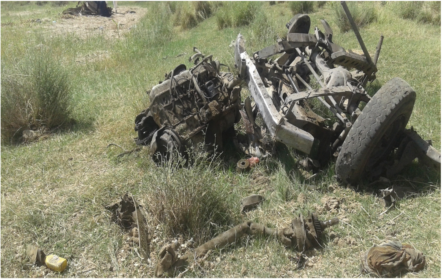
Remnants of the civilian pick-up truck struck in Al-Awlah valley.