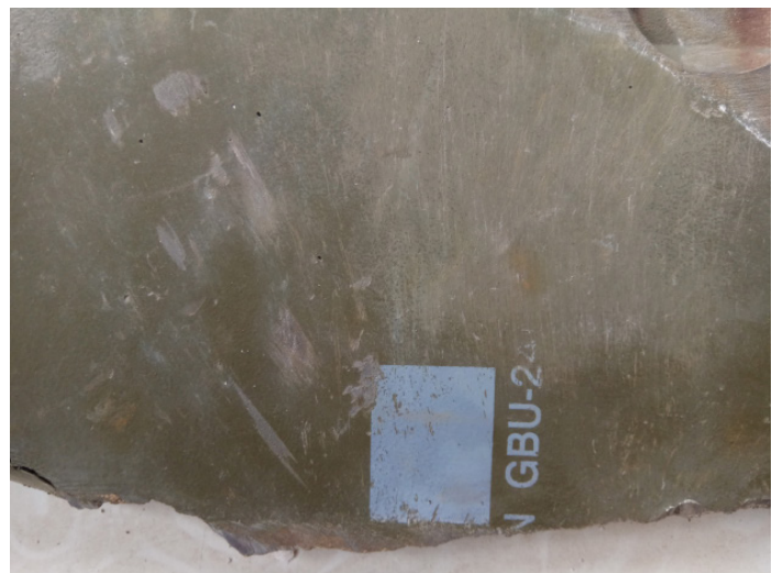
Remnants of a large guided bomb unit recovered at the scene of the attack on Hani Yahya's home. In the top photos, the marking "96214" identifies Raytheon as the manufacturer and the marking "09/2010" indicates that the part was manufactured in September 2010. The marking on the remnant in the bottom photos identifies the weapon as a likely US-made GBU-24 bomb.