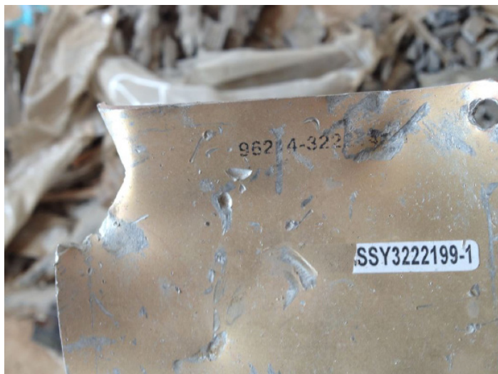
A remnant of a large guided bomb unit recovered at the scene of an attack on a civilian home in Amanat Al-Asimah Governorate (see Section II). The marking “96214” identifies US defense contractor Raytheon as the manufacturer.