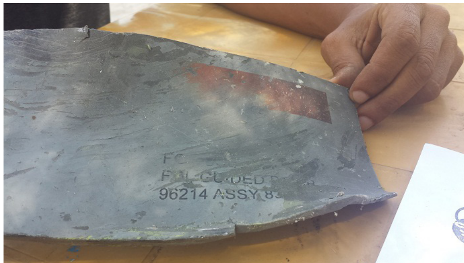
Remnant of a Raytheon-manufactured guided bomb unit recovered at the scene of the attack on the Cultural Center. The marking “96214” refers to US defense contractor Raytheon’s CAGE number.