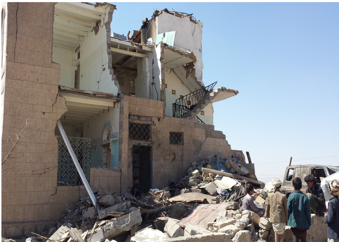
Scene from aftermath of September 2015 airstrike on Wālan Agricultural Complex in Bilad Ar-Rus District, Sana'a Governorate

Wounded in Sana’a Governorate September 2015