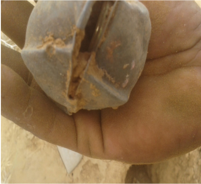
A US-made BLU-63 submunition found at the scene of an attack that killed fifteen civilians, including nine children, in Midi District, Hajjah Governorate (see Section II). BLU-63 submunitions are generally released from the CBU-58 cluster bomb, which disperses 650 of the submunitions widely and indiscriminately.

failed to operationalize solutions JIAT recommends. 24 Moreover, JIAT has investigated a small portion of the incidents that human rights organizations and international bodies have identified as likely violations of international humanitarian law, including only a small fraction of the 27 apparently unlawful attacks documented in this report. 25 Publicly released JIAT investigation results absolve Coalition members of responsibility in the vast majority of attacks—contrary to the results of independent fact-finding. 26 JIAT has failed to investigate certain alleged IHL violations altogether and made no effort to determine individual criminal responsibility for war crimes. 27 In the few cases in which JIAT has recommended further investigation or compensation for victims, there is no evidence of credible follow-up by Coalition states on the recommendations. 28 As currently constituted, this body does not meet the standards necessary to fulfill Coalition countries' requirements