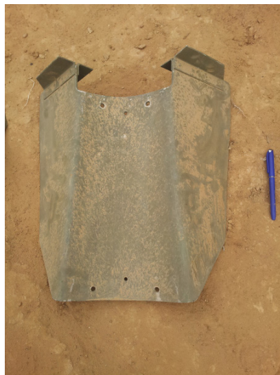
A remnant of a likely US-made CBU-58 cluster bomb used in the attack on Mohammed Saheli’s farm. The remnant pictured appears to be a tail unit of the bomb. The CBU-58 cluster bomb disperses about 650 BLU-63 submunitions widely and indiscriminately.