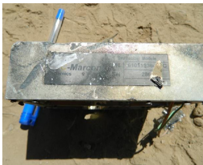
Remnants of a UK-made “Hakim” A series precision guided munition (PGM) found at the scene of the attack on the community college. The markings on the remnant in the photo on the right identify GEC-Marconi Dynamics as the manufacturer.