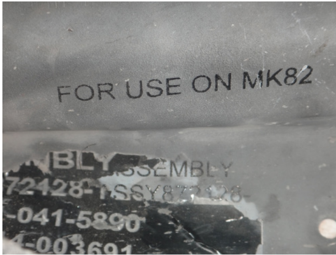
Remnant of a US-made GBU-12 Paveway II bomb used in an attack on a civilian home in Dar Sa'ad District, Aden Governorate (see Section II). As the marking "FOR USE ON MK82" indicates, an Mk-82 warhead was mounted on the GBU-12 bomb. The marking "1325-01-041-5890," parts of which are visible in the photo, is associated with a Raytheon-manufactured wing assembly.

military assistance to Saudi Arabia and the UAE.