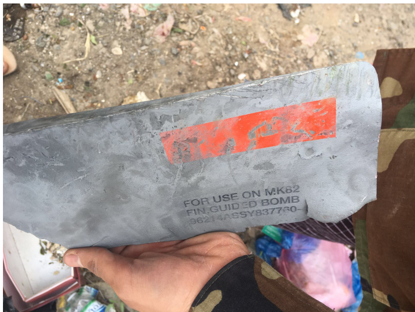
A remnant of the US-made GBU-12 Paveway II laser-guided bomb that killed six members of the Al-Jum'a'i family. As the marking "FOR USE ON MK82" indicates, an Mk-82 warhead was mounted on the GBU-12 bomb. The marking "837760-4" is associated with the guidance fin for the Mk-82/GBU-12. The marking "96214" identifies Raytheon as the manufacturer of the weapon.

building. JIAT's findings are also inconsistent with those of the UN Panel of Experts, which concluded after its own investigation that the Coalition attacked the Ibb residential complex.