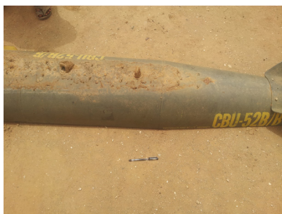
The US-made CBU-52 cluster bomb remnant recovered at the scene of the attack in Al-Sir village. The CBU-52 contains 217 BLU-61 submunitions that disperse indiscriminately and widely—across an area equivalent to over twenty-two football fields.