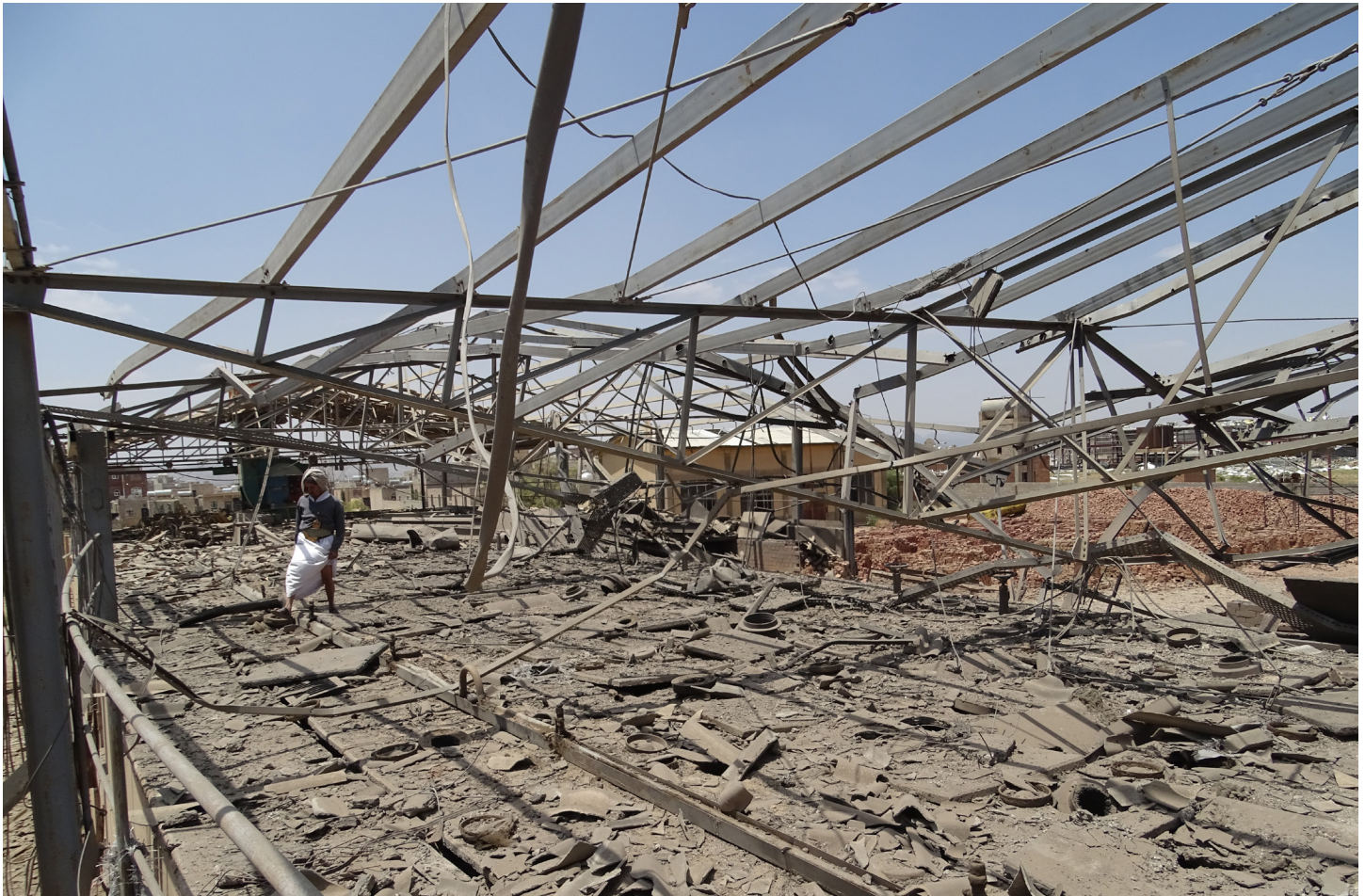
Man walks through rubble after September 2016 airstrike on Al-Senidar Factory Complex in Bani Al-Harith District, Amanat Al-Asimah Governorate.

which struck civilian structures, including homes, a farm, and a fishing boat—were foreseeable. The US should adhere to its own policy directives, a growing international consensus against cluster munitions, and IHL prohibitions on indiscriminate attacks and reinstate a ban on the export of cluster munitions to Saudi/UAE-led Coalition countries.