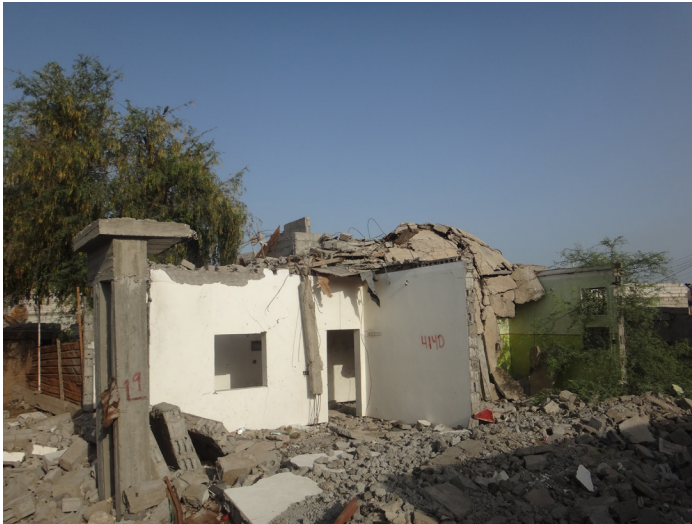
Destruction from April 2015 airstrike on civilian home in Dar Sa'ad District, Aden Governorate

The 2017 House resolution did not come to a vote. The House instead passed a non-binding resolution noting that Congress had not specifically authorized use of force against parties in the Yemeni civil war not covered by the 2001 AUMF or the AUMF on Iraq. 126 In February 2018, 14 Senators introduced another