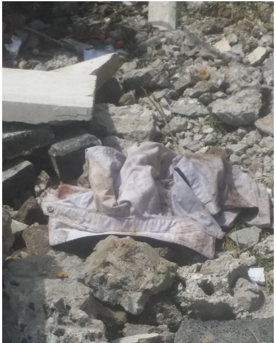
A tuft of human hair and a bloodied shirt, both believed to have belonged to 3-year-old Dhia Al Duais or 4-year-old Muhammed Al Duais. Both children were killed in the attack, their bodies mangled.