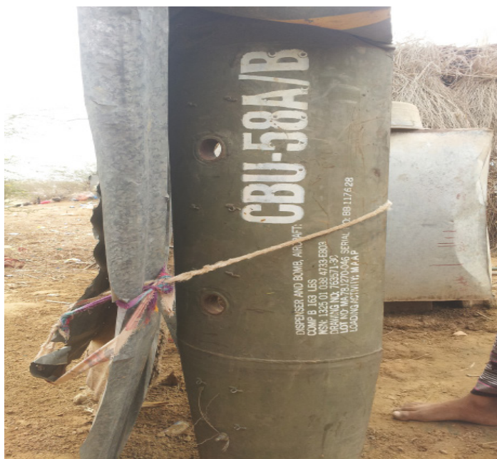
A US-made CBU-58 cluster bomb casing recovered at the scene of the attack in Bani Haddad village. The CBU-58 cluster bomb disperses about 650 BLU-63 submunitions widely and indiscriminately.