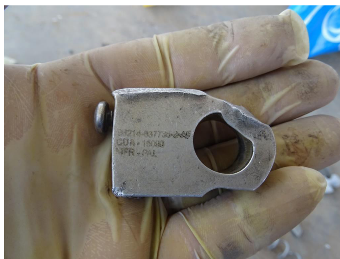
Remnants of a Raytheon-manufactured bomb recovered at the scene of a Coalition attack on a civilian factory complex (see Section II). The marking “96214” refers to Raytheon’s CAGE number.

businesses both “avoid infringing on the human rights of others” and “address adverse human rights impacts with which they are involved.” 141 These responsibilities exist independently of States’ abilities or willingness to fulfill their human rights obligations. 142 In situations of armed conflict, businesses are expected to respect international humanitarian law. 143