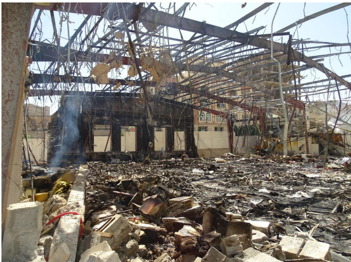
Scene from aftermath of October 2016 airstrike on funeral in As-Sabain District, Amanat Al-Asimah Governorate

Wounded in Amanat Al-Asimah Governorate October 2016