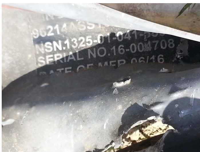
Remnant of the US-made GBU-12 wing assembly that struck the vehicle packed with children and women in Al-Awlah agricultural valley. The marking “96214” identifies Raytheon as the manufacturer. The marking “DATE OF MFR 06/16” indicates that the wing assembly was manufactured in June 2016.

the 15 civilians. 1 JIAT claimed that the Coalition had intelligence indicating the vehicle was carrying leading Houthi commanders 2 and that “secondary explosions” took place when the Coalition struck the vehicle, “meaning that the vehicle was carrying weapons and ammunition along with the Houthi commanders.” 3 JIAT’s findings are entirely inconsistent with the evidence gathered by