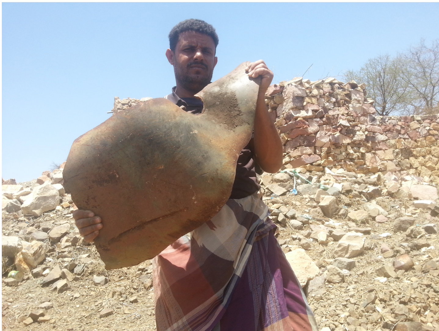
A man holds a remnant of a US-made Mk-82 bomb found at the site of a Coalition attack on a school and health clinic in At-Ta'iziyah District, Taizz Governorate (see Section II).

The United States has a long history of military cooperation with Saudi Arabia and the United Arab Emirates. Military cooperation between Saudi Arabia and the United States dates back to the 1950s, when the US built its first military base in the country. 1 Bilateral agreements in the 1950s and 1970s established the United States Military Training Mission in Saudi Arabia and the Saudi Arabian National Guard Modernization Program to oversee defense cooperation between the two countries. 2 The US and