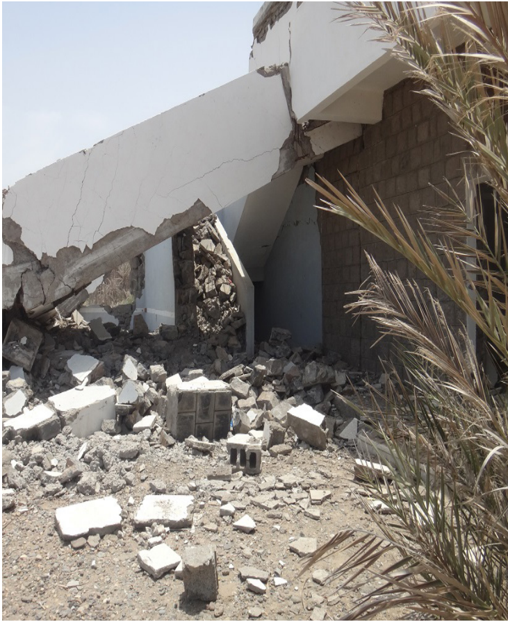
Destruction from airstrikes on Sheikh Ahmed Al-Faza Primary School in At-Tuhayat District, Hudaydah Governorate