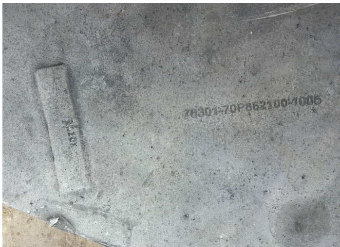
Remnants of a likely US-made JDAM GBU-31 bomb used in the attack that killed the Al-Sanabani family. The four securing holes pictured in the photo on the top resemble those of a JDAM GBU-31 tail fin. The marking “76301-70P86” in the photo on the bottom is associated with JDAM guidance part numbers.

and others, JIAT has reported that the Coalition did not carry out a strike despite clear physical evidence indicating an airstrike. 3