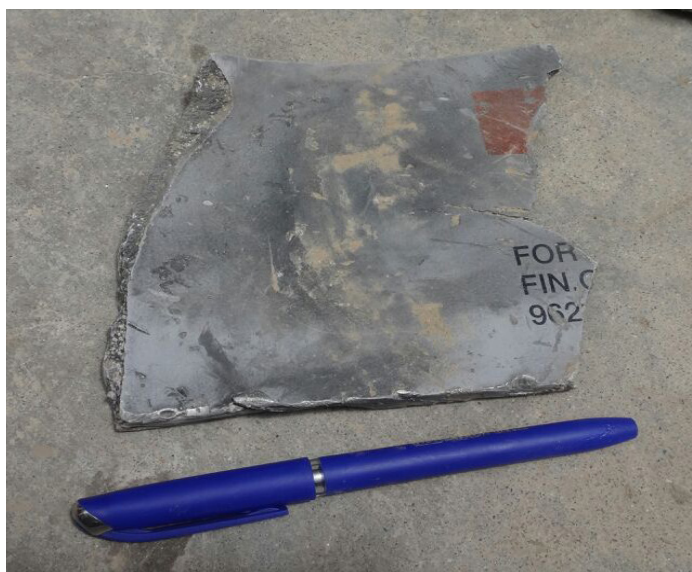
A remnant of what appears to be a guided bomb unit found at the scene of the attack on Al-Khansa Girls' School. The marking "962" appears to be the initial digits of US defense contractor Raytheon's CAGE number (96214), likely identifying Raytheon as the manufacturer of the part.

The Saudi/UAE-led Coalition attack appears to have been indiscriminate. Researchers and witnesses did not identify any