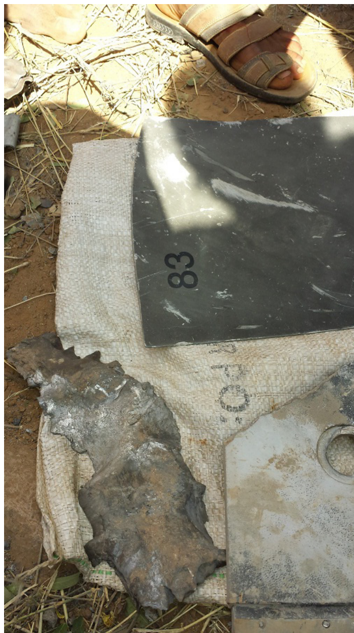
Remnants of a likely US-made Mk-83 warhead recovered at the scene of an attack in Bajil District, Hudaydah Governorate (see Section II).