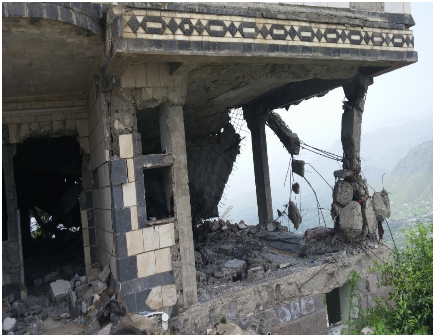
Damage from August 2015 airstrike on civilian homes in Al-Dhibar District, Ibb Governorate

the benefit of their sustenance value is forbidden. 14 Although targeting such an object may be permissible if an opposing party is using the object in direct support of military action, any attack that is expected to result in starvation or forced displacement of the civilian population is prohibited. 15