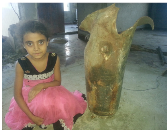
Remnant of a US-made Mk-82 bomb casing used in the attack on Hamoud Qayed's home (girl in photo on right shown for scale). The marking "BURKAN MUNITIONS SYSTEMS" indicates that the initially empty bomb was likely loaded with explosives at the ammunition factory of Burkan Munitions Systems, a UAE government company.

Systems. 7 Between 2010 and 2013, the US delivered 938 Paveway Guided Bombs to the UAE. 8 The Saudi/UAE-led Coalition has dropped US-made Mk-82 bombs on civilians and civilian infrastructure repeatedly since the start of the war. CNN reported that the Coalition used Lockheed Martin's Mk-82 Paveway bomb in a widely-condemned August 2018 airstrike on a school bus that killed dozens of children. 9 Ten of the twenty-seven apparently unlawful Coalition attacks documented in this report likely involved Mk-82 bombs.