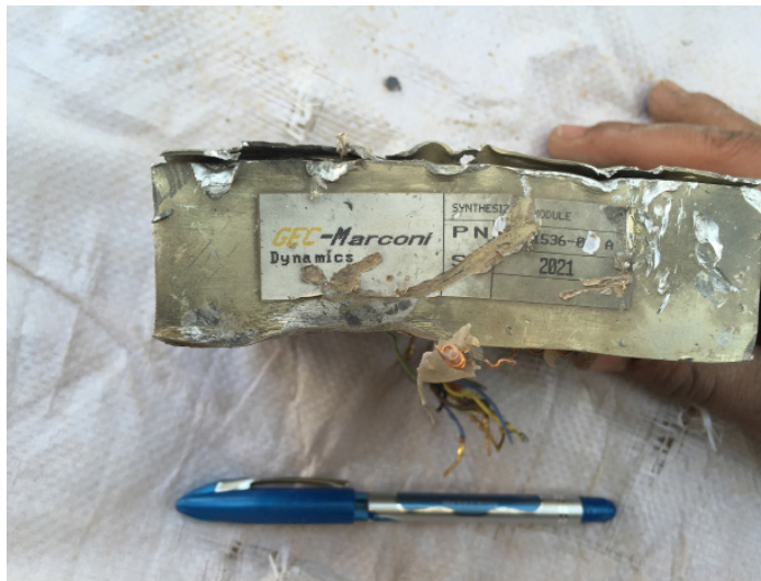
Remnants of a UK-made "Hakim" A series precision guided munition (PGM) recovered at the scene of the attack on Radfan Ceramics Factory. According to Armament Research Services, the solid rocket motor venturi on the cinder block in the top right of the photo on the left is consistent with the Hakim PGM bomb. The markings on the remnant in the photo on the right identify GEC-Marconi Dynamics as the manufacturer.