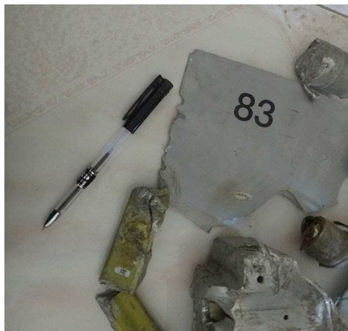
Remnants of a US-made Mk-83 warhead found at the scene of the attack on Al-Kahlani Factory. The Mk-83 warhead is associated with the GBU-16 Paveway II bomb. Left: The marking "8,000 PSI" is consistent with the gas containers of a number of GBU forward control units, which are pressurized to 8,000 PSI. The marking "252746-5" is associated with Raytheon aircraft parts.