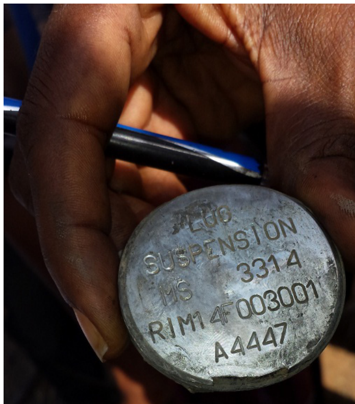
Remnants of a likely US-made GBU-16 bomb recovered at the scene of the attack in Dir Al Hajri village. The number 83 in the photo on the left appears to be associated with the Mk-83 warhead. The marking “MS3314” in the photo on the right is associated with 1000-pound bomb suspension lugs, which are consistent with the Mk-83.

posed sales of weapons to Saudi Arabia included $298 million for Paveway II and III, Enhanced Paveway II and III, and Paveway IV Weapons Systems. 4 Between 2010 and 2013, the US delivered 938 Paveway Guided Bombs to the UAE. 5