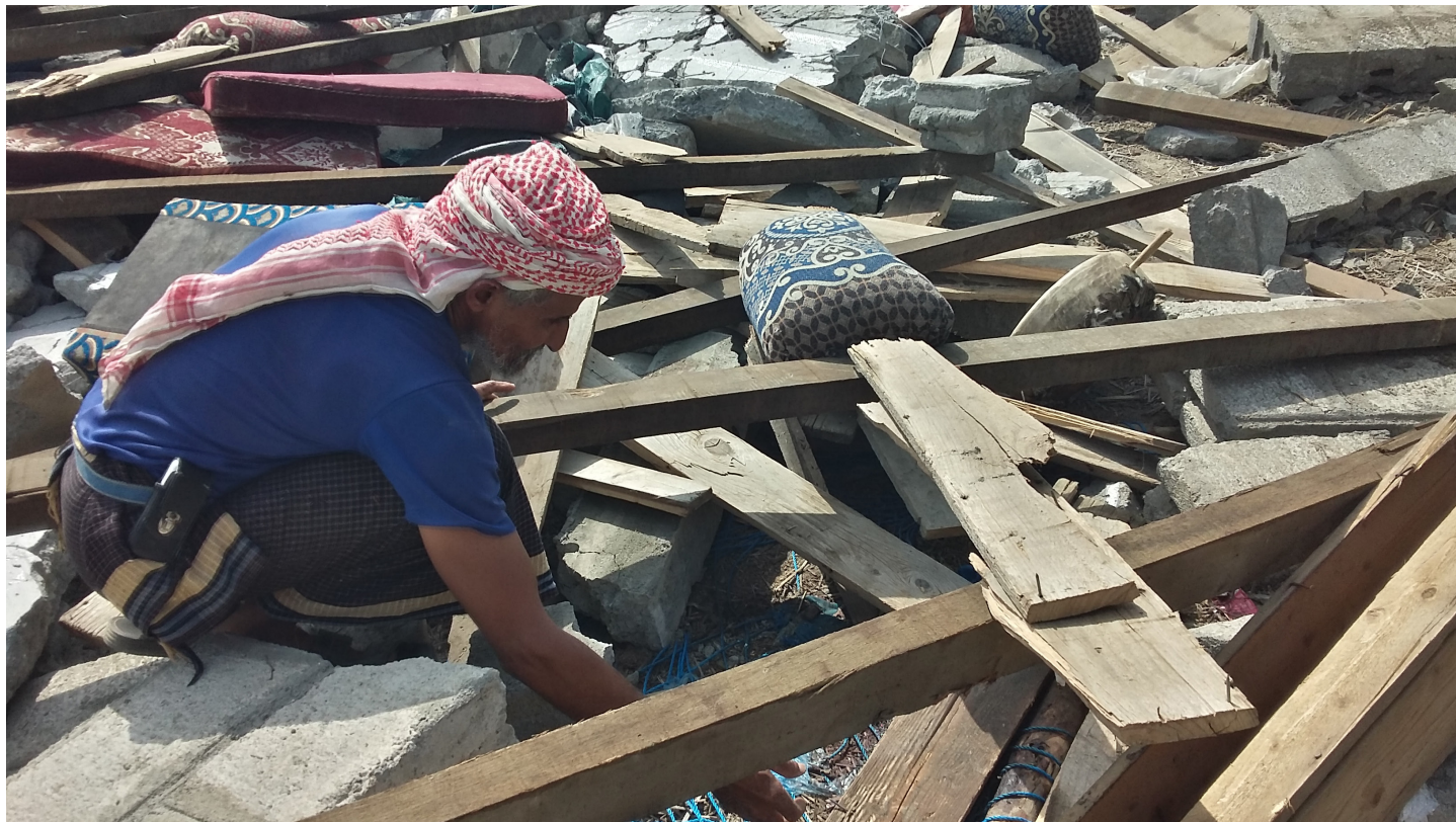
Man sorts through rubble after April 2018 airstrike on wedding in Bani Qais District, Hajjah Governorate.

edge that rendered future violations foreseeable. 60 According to the ICRC Commentaries, the positive obligation to “ensure respect” for the Conventions requires a due diligence process to mitigate or prevent violations when providing assistance to a warring party. 61 The Coalition’s repeated use of weapons provided by the US and European countries for attacks in violation of IHL, and the continued provision of weaponry despite the failure of attempted mitigation measures, indicate that these supporting States are violating their obligations to respect and ensure respect for the Geneva Conventions.