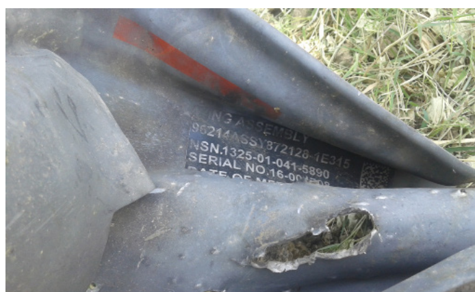
Remnant of a US-made GBU-12 wing assembly recovered at the scene of an attack that killed fifteen civilians, including twelve children, in Al-Matmmah District, Al-Jawf Governorate (see Section II). The marking “96214” identifies Raytheon as the manufacturer.

for a discount on US military training purchased through the Foreign Military Sales program. 14 Military assistance to Saudi Arabia has been controversial since the early 2000s due to concerns about the Kingdom’s human rights record and commitment to counterterrorism. 15 Between 2004 and 2009, Congress passed legislation that would have prohibited aid to Saudi Arabia in the absence of waivers by the Bush and Obama administrations. 16 As outlined in Section III of this report, since the beginning of the Yemen conflict, members of Congress have increasingly objected to—and proposed legislation to halt—the provision of arms and other US