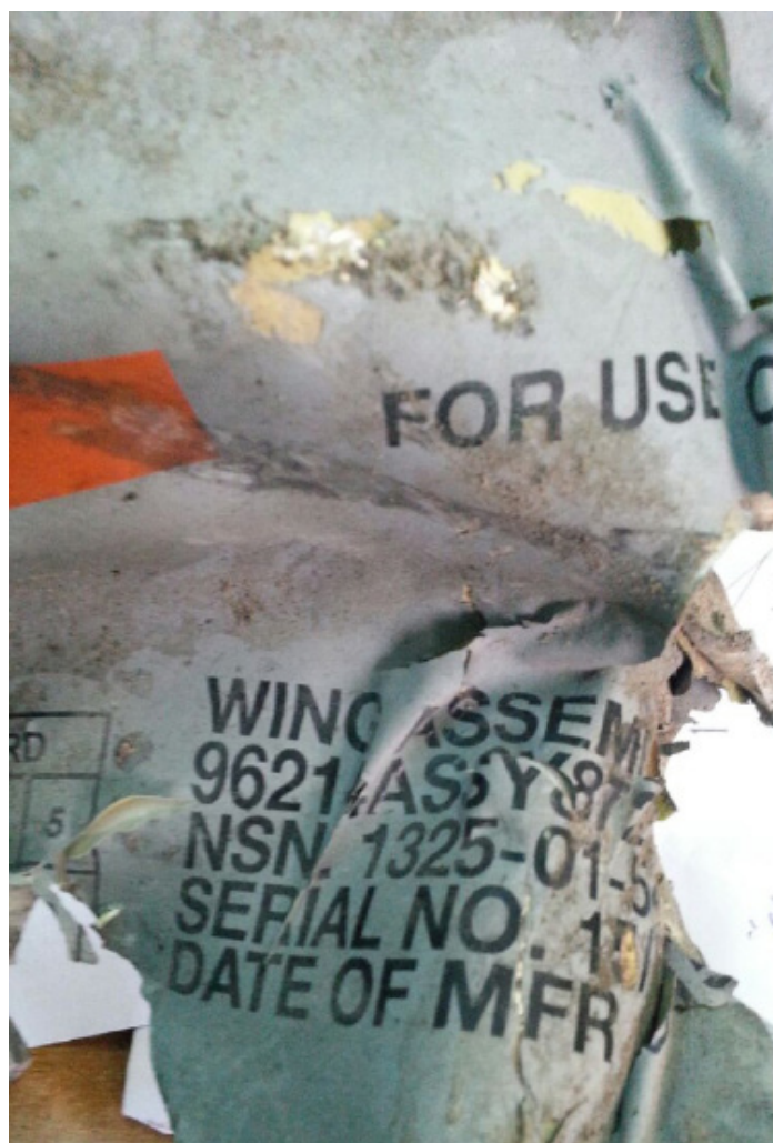
Remnant of a likely UK-made Paveway IV bomb (used with a US-made Mk-82 warhead) found at the scene of the attack on Derhim Industrial Factory. The markings on the remnant indicate that it is likely part of the Paveway IV bomb’s wing assembly. The marking “96214” identifies Raytheon as the manufacturer.

identity of Raytheon UK’s first and only export customer—undisclosed by the defense contractor—was confirmed to be Saudi Arabia. 9 In the third quarter of 2015, the UK approved £1 billion of export licenses to Saudi Arabia, a dramatic increase from the £9 million approved in the same period in 2014. 10 These deals included Paveway IV bombs originally meant for the UK Royal Air Force but delivered instead to Saudi Arabia, which reportedly needed to restock its supply of the bomb for use in Yemen. 11 In 2017, then-director general of security policy at the UK Ministry of Defence, Peter Watkins, revealed that the UK has trained Saudi air force personnel in the use of the Paveway IV. 12