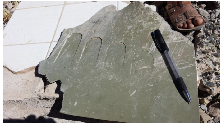
Remnants of a likely US-made GBU-24 Paveway III laser-guided bomb found at the scene of the attack on the Wa'lan Agricultural Complex. The photo on the right appears to show the forward fin of a guided bomb unit. The parallel indents with circular ends match the configuration of the GBU-24. The photo on the left appears to show the tail wing of a guided bomb unit. The two indents match the configuration of the GBU-24.

warned that the jets will strike again and didn't allow us to enter the building," Mohammed explained.