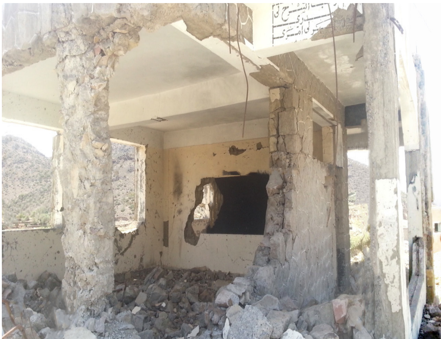
Scene from aftermath of June 2015 airstrike on Uqba bin Nafie School and Al-Masnah Health Clinic in At-Tā'iziyah District, Taizz Governorate

Eyewitness to attack in Taizz Governorate June 2015