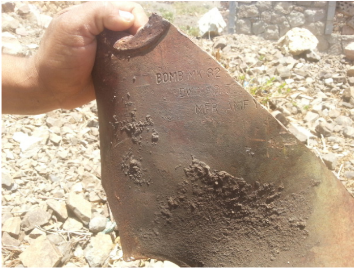
A remnant of a US-made Mk-82 bomb casing recovered at the scene of the attack on Uqba bin Nafie School and Al-Masnah Health Clinic.