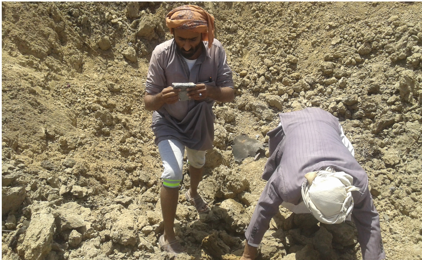
Residents search for weapons remnants after September 2016 airstrike that killed twelve children and three women in Al-Matmmah District, Al-Jawf Governorate (see Section II).

numbers of cluster munitions to Saudi Arabia. In August 2013, the countries concluded a contract for 1,300 CBU-105 Sensor Fuzed Weapons, cluster munitions made by Textron Defense Systems, to be delivered by December 2015. 42 The countries had previously, in 2011, announced a deal for the sale of 404 CBU-105s. 43 The US notified Congress of several transfers of cluster munitions to Saudi Arabia before 1995, including 1,000 CBU-58, 350 CBU-71, 1,200 CBU-87, and 600 CBU-87 cluster bombs. 44 Reports of US-made cluster munition use in the ongoing conflict in Yemen include CBU-105, CBU-58, CBU-87, and M26 rocket