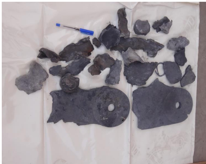
Weapons remnants recovered at the scene of the Sana'a funeral attack. Pen shown for scale. A US-made GBU-12 Paveway II bomb was identified by Human Rights Watch as one of the weapons used in the attack.

cause incidental loss of civilian life or damage to civilian structures that is excessive in relation to the attack's anticipated concrete and direct military advantage, it is unlawfully disproportionate. Hundreds of civilian casualties were the entirely foreseeable result of the Coalition's attack on the densely packed, public funeral gathering. Laws of war violations carried out intentionally or recklessly are war crimes.