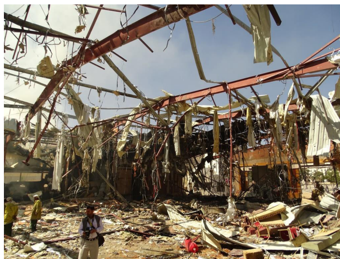
Destruction from October 2016 airstrike on funeral in As-Sabain District, Amanat Al-Asimah Governorate