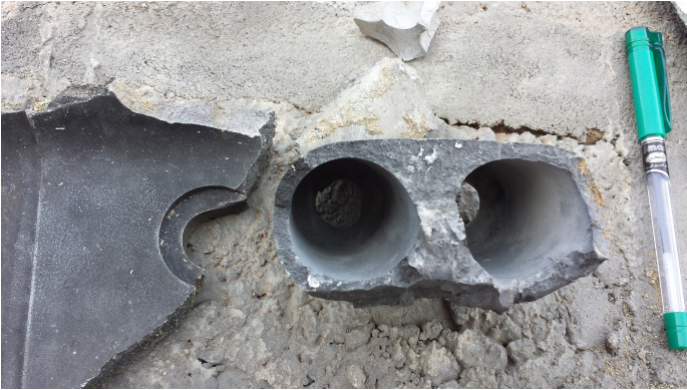
Remnants of a US-made GBU-12 Paveway II laser-guided bomb recovered at the scene of the wedding attack. Pen shown for scale.