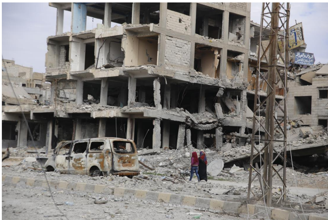
Women walking in rubble-strewn street past destroyed buildings in Raqqa.

Amnesty International’s August 2017 report also detailed IS abuses against civilians during the battle for Raqqa, particularly IS’s use of civilians as human shields as the conflict got underway and the group redoubled efforts to prevent residents from leaving the city. IS laid mines/IEDs to slow advancing SDF forces and to render exit routes impassable, 7 set up checkpoints around the city to prevent residents from leaving, and its snipers shot and deliberately killed civilians who tried to escape. 8 As the SDF captured neighbourhoods and front lines shifted within the city, IS forced residents to move deeper into areas which remained under its control.