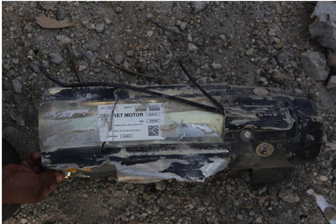
Fragment of the motor of a US-made AGM-114 Hellfire missile recovered among the ruins of the Aswad family building, destroyed in a Coalition strike which killed eight civilians on 28 June 2017.