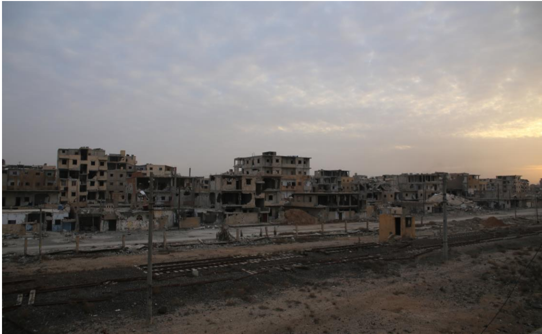
Destroyed neighbourhood in Raqqa.

strikes, at the time that the military operation was still under way. 105 A Coalition official dismissed the concerns raised by Amnesty International and by the UN Special Advisor on Syria, who had called for a pause in hostilities to allow civilians out of the city. 106 The Commander of Coalition forces, Lieutenant General Stephen Townsend acknowledged that, after an escalation in attacks, “it is logical to assume there has been some increase in civilian casualties” , before going on to cast doubt over Amnesty International’s findings, saying, “I would ask someone to show me hard information.” 107 He further stated: “I think we are being as careful as we need to be and as we can be, and I would challenge the individual from the UN who made this hyperbolic statement that civilian casualties are staggering. Show me some evidence of that.” 108 US Defense Secretary James Mattis’ only response was: “We are the good guys and the innocent people on the battlefield know the difference.” 109