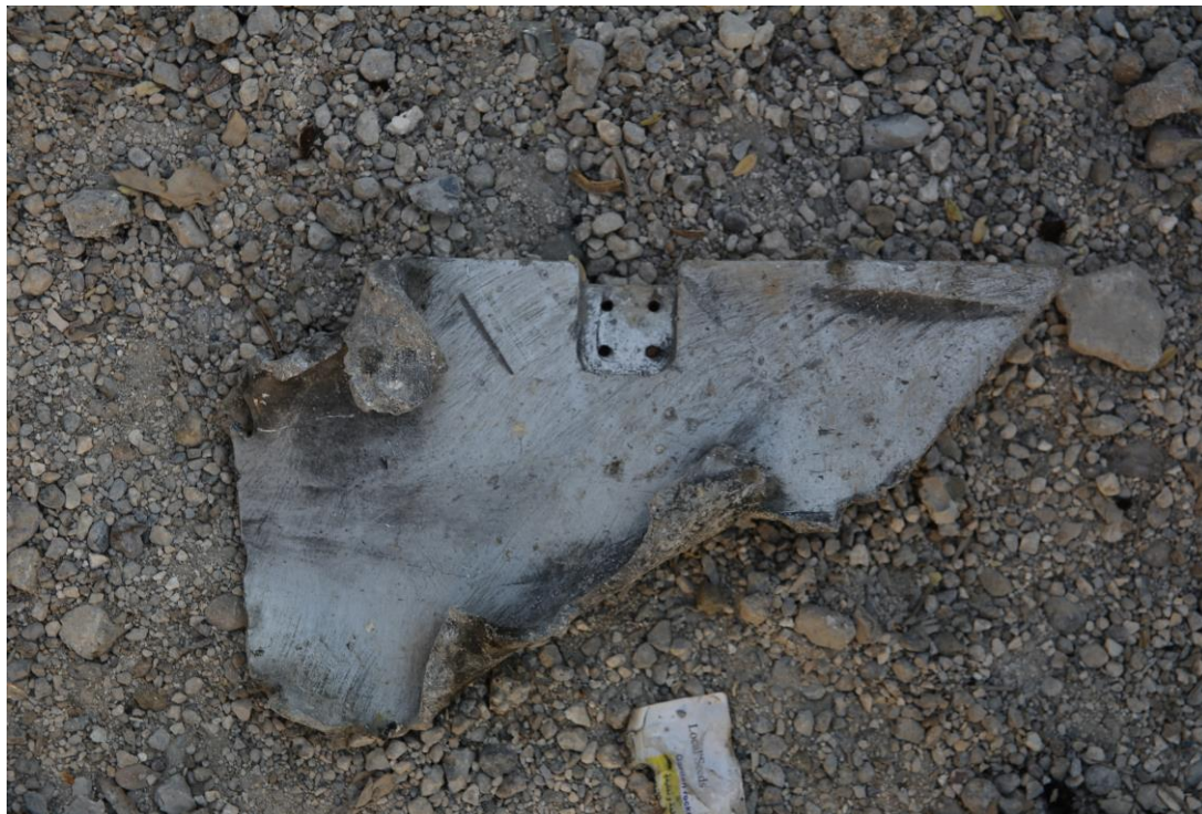
Fragment of a fin from a US-designed Joint Direct Attack Munition (JDAM), a GPS-guided air-delivered bomb, recovered among the ruins of the Aswad family building, destroyed in a Coalition strike which killed eight civilians on 28 June 2017.