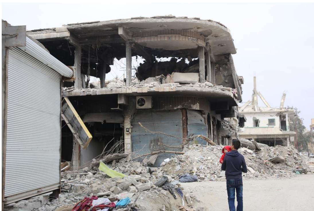
A young man holding a child staring at the ruins of bombed buildings in Raqqa.

Seven were killed and the rest were injured. Most of the dead and injured were women and children. The survivors had no option but to return home. A few days later a Coalition air strike destroyed their home, killing nine members of the family, mostly women and children.