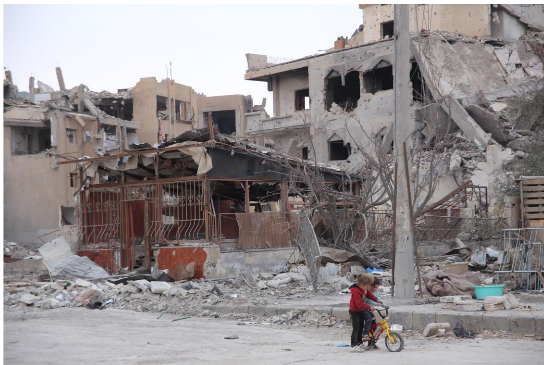
Children riding a bicycle among destroyed buildings in Raqqa.

aware of any Coalition investigators having visited any strike sites anywhere in the city or having interviewed survivors or witnesses of other strikes. Such shortcomings in the investigation methodology appear to be a significant contributing factor to its dismissal of almost all the reports of civilian fatalities and casualties. 122