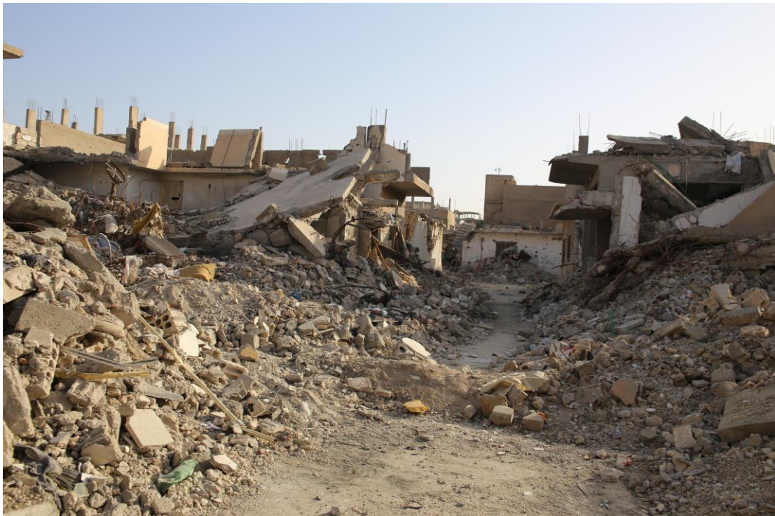
The ruins of the destroyed house where 28 members of the Badran family and five neighbours were killed in a Coalition strike on 20 August 2017 in Raqqa.

We went to Sharia al-Mansour and we took shelter in a two-storey house but after four days there Daesh forced us to move towards al-Fardous and Harat al-Badu neighbourhoods. So we went to Nazlet al-Shehade. On 18 July we fled from there because the fighting was getting closer. As we were fleeing nine of our relatives were killed in two bombardments – five of them in one of the houses just as they were about to leave and four others in the car. We had just left along with the rest of the women and children while the men were still at the house preparing to leave when the house and the car were bombed.