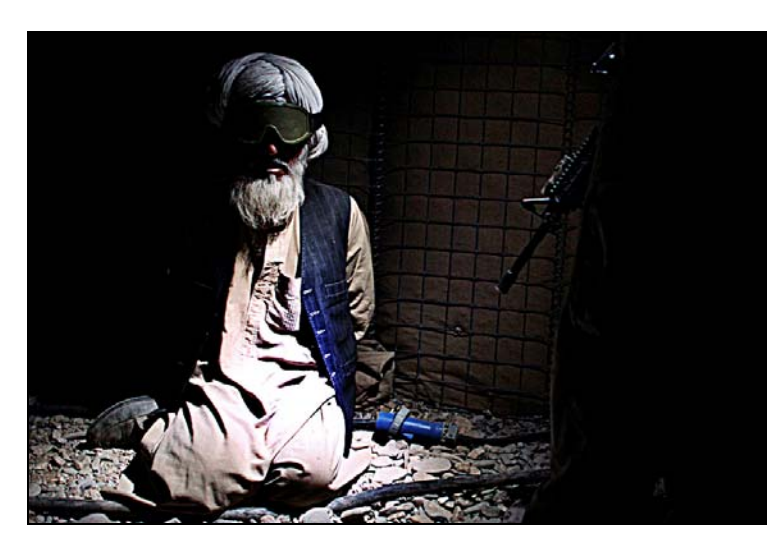
An Afghan man detained by U.S. Marines at base in Talibjan, November 7, 2010.

opportunity to observe more of these Afghan trials as the United States develops its training and mentoring program at the DFIP.