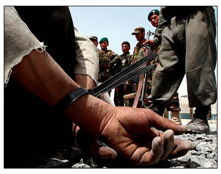
Afghan soldiers look at detained suspected Taliban fighters in Patrol Base Wilson in Zhari district early April 19, 2008.

In this latest trip, we found that the U.S. system for determining who is legally detainable has improved since the completely secret process used during the Bush administration. Significantly, the Obama administration now allows detainees to attend at least a portion of a hearing and address a board of U.S. military officers. Each detainee is assigned a "personal representative" to help present his case, and is entitled to a new status hearing every six months. The military has also implemented some of the recommendations that Human Rights First made in its last report, such as allowing human rights organizations to observe detainee hearings; excluding evidence obtained through torture or cruel, inhuman or degrading treatment; and making efforts to improve the