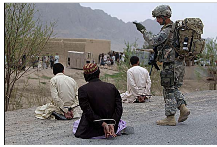
U.S. Army soldier stands guard next to detained Afghan men in the Arghandab valley in Kandahar province February 26, 2010.

In each interview, Human Rights First asked the detainee what specifically the P.R. did for him, both before the hearing and afterwards. In each case, the detainee said that the P.R. met with him once or twice before the hearing, but did not present any witnesses or evidence pertaining to the relevant facts or the charges alleged. In no case did the P.R. challenge evidence presented by the Recorder, or question live witnesses. At most, in some cases the P.R. arranged for family members or village elders to attend the DRB and act as a character witness for the detainee.