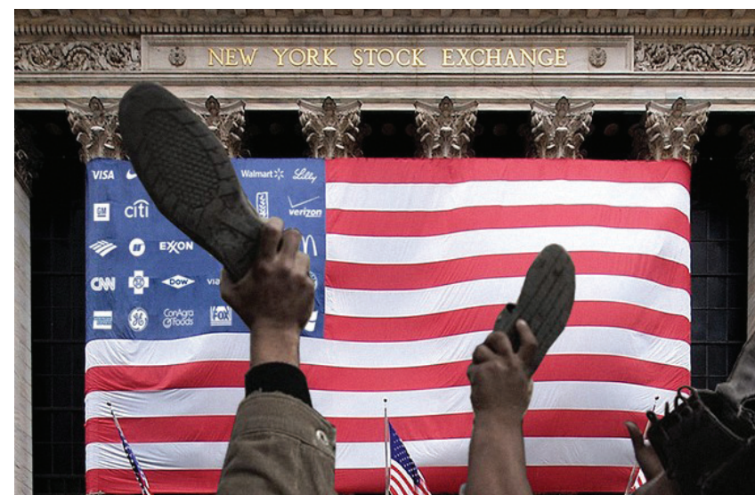
Daily marches around Wall Street have launched a movement. Graphic: Adbusters

The Wall Street occupation has succeeded in revealing how corporations, politicians, media and police have failed us as institutions offering something positive to humanity. Our current leaders tell us they will spread the financial pain by imposing the "Buffett Rule," a tax increase that asks the wealthy to sacrifice the equivalent of a tin of caviar per year.