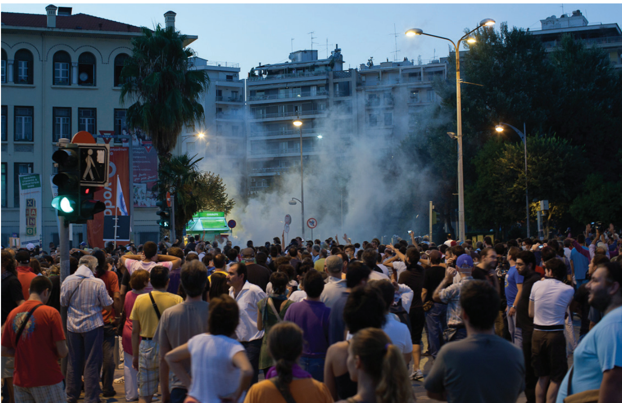
ECONOMIC SHOCK, SOCIAL CRISIS: Tens of thousands challenge the Greek government and European bankers at the Thessaloniki Expo, Sept. 10. Police deployed military-grade tear gas against the largely peaceful protesters.