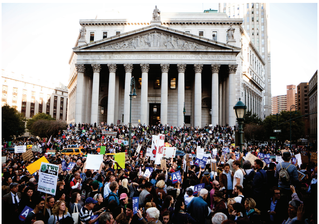
FOLEY SQUARE, OCT 5.

"The United Steelworkers union, North America's largest industrial union with 1.2 million active and retired members, stands in solidarity with and strongly supports Occupy Wall Street. The brave men and women, many of them young people without jobs, who have been demonstrating around-the-clock for three weeks in New York City, are speaking out for the many in our world. We are fed up with the corporate greed, corruption and arrogance that have inflicted pain on far too many for far too long. Our union has been standing up and fighting these captains of finance who promote Wall Street over Main Street. We know firsthand the devastation caused by a global economy where workers, their families, the environment and our futures are sacrificed so that a privileged few can make more money on everyone's labor but their own."