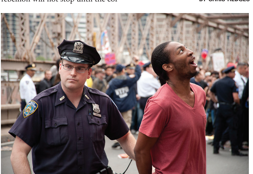
UNAFRAID: Despite 700+ arrests on the Brooklyn Bridge on Oct. 1, crowds surged in the following days.