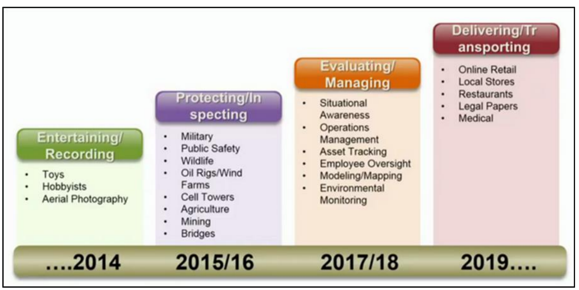
Figure 2. Potential Growth in Commercial Use of UAS

Figure 2 shows one analyst's forecast of how the commercial capability might unfold.