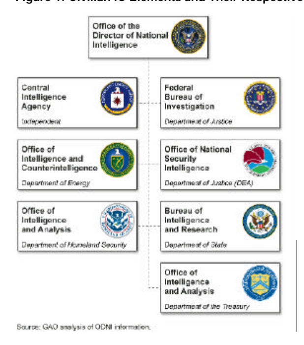
Figure 1: Civilian IC Elements and Their Respective Departments

Program. <sup>10</sup> The IC comprises 17 different organizations, or IC elements, across the federal government represented by 6 executive departments. These IC elements include ODNI, seven other civilian IC elements, and nine military IC elements. The eight civilian IC elements within the scope of our review include two intelligence agencies and six intelligence components within five departments (see fig. 1). <sup>11</sup> For the purposes of this review, we are referring to the eight as the civilian IC elements. Appendix III provides additional information on each of the eight civilian IC elements' missions.