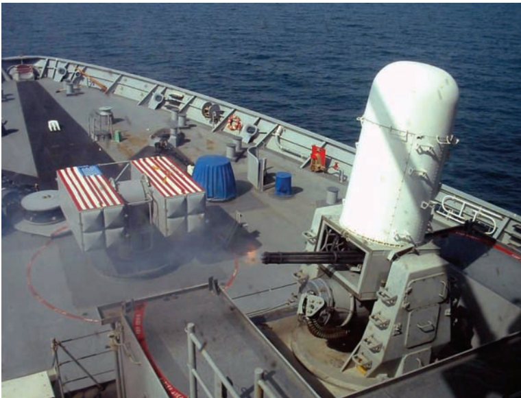
The US Navy's MK 15 Phalanx Close-In Weapons System is designed to identify and fire at incoming missiles or threatening aircraft. This automatic weapons defense system, shown during a live fire exercise, is one step on the road to full autonomy.

Automatic weapons defense systems represent one step on the road to autonomy. These systems are designed to sense an incoming munition, such as a missile or rocket, and to respond automatically to neutralize the threat. Human involvement, when it exists at all, is limited to accepting or overriding the computer's plan of action in a matter of seconds.