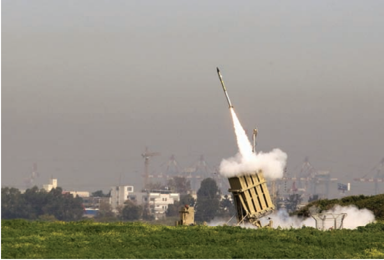
An Iron Dome, an Israeli automatic weapons defense system, fires a missile from the city of Ashdod in response to a rocket launch from the nearby Gaza Strip on March 11, 2012. The Iron Dome sends warnings of incoming threats to an operator who must decide almost instantly whether to give the command to fire.

80 percent success rate, “has shot down scores of missiles that would have killed Israeli civilians since it was fielded in April 2011.” 32 In a split second after detecting an incoming threat, the Iron Dome sends a recommended response to the threat to an operator. The operator must decide immediately whether or not to give the command to fire in order for the Iron Dome to be effective. 33