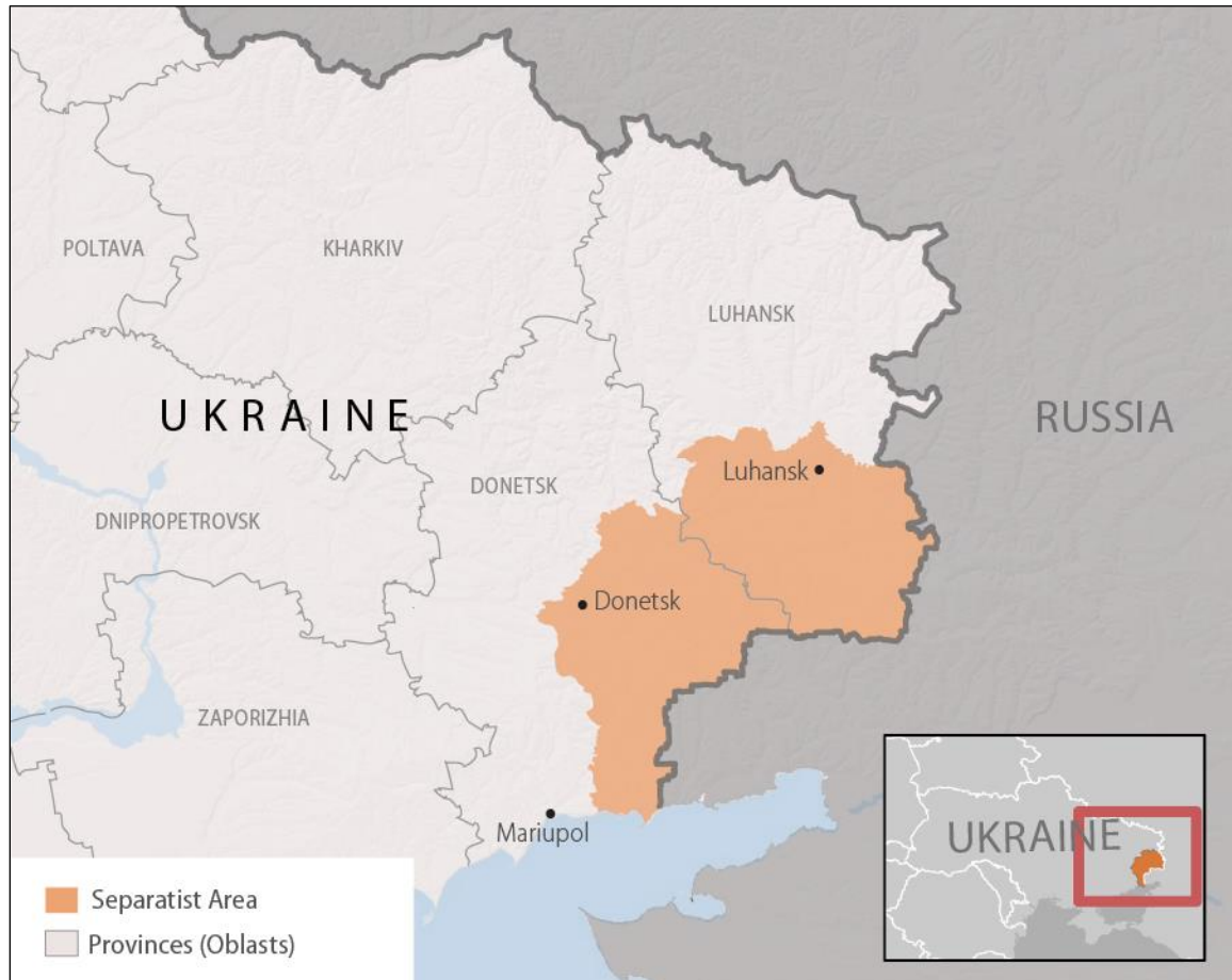
Figure 3. Separatist Regions in Eastern Ukraine

Sources: Graphic produced by CRS. Map information generated by Hannah Fischer using data from the National Geospatial Intelligence Agency (2016), the Department of State (2015), and geographic data companies Esri (2014) and DeLorme (2014).