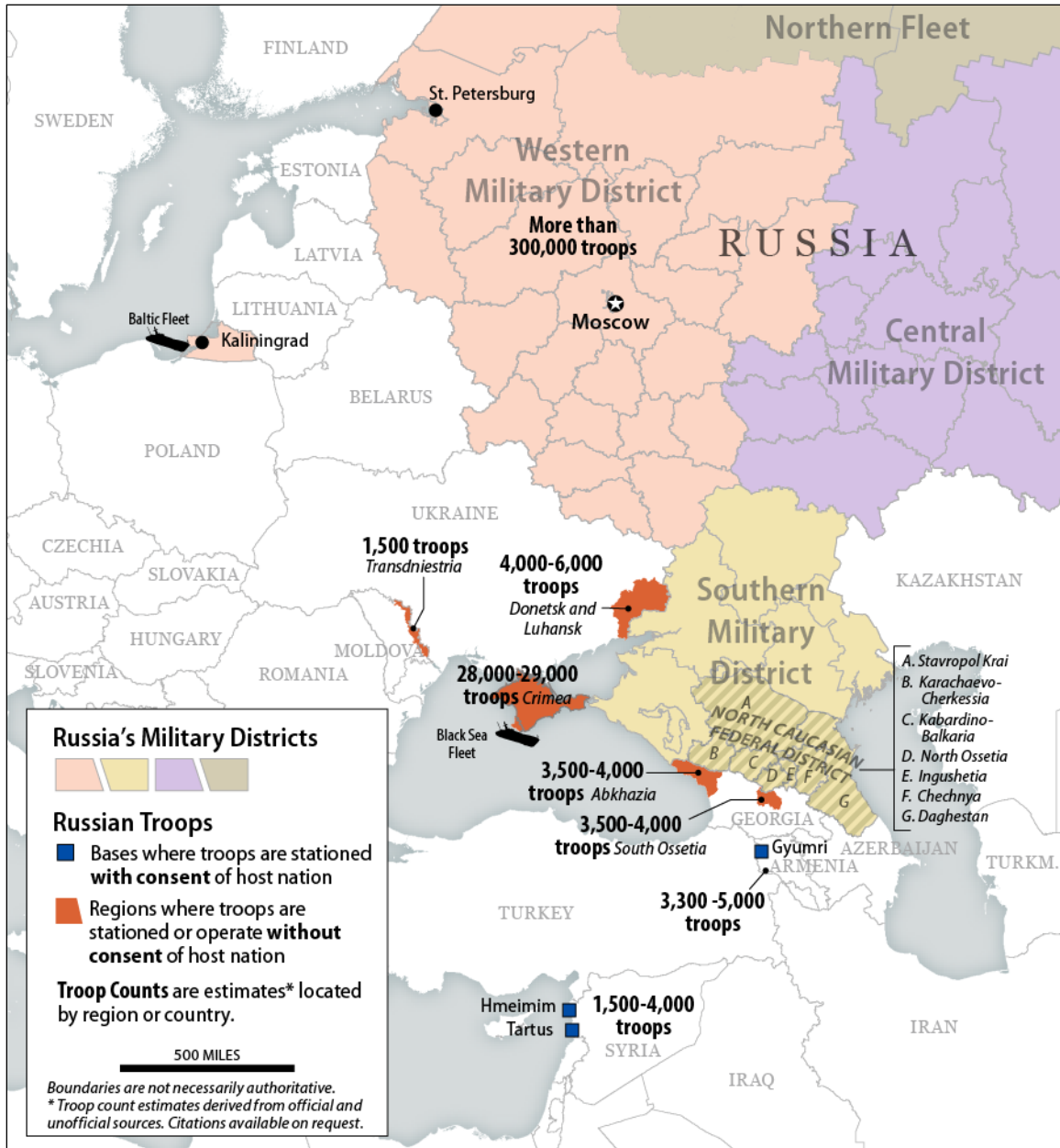
Figure 4. Russia's Military Footprint in Europe

Sources: Graphic produced by CRS. Map information generated by Hannah Fischer using data from the Department of State (2015 and 2016); geographic data companies ArcWorld (2014) and DeLorme (2014); and the U.S. interagency Humanitarian Information Unit (2016); and IISS Military Balance (2017).