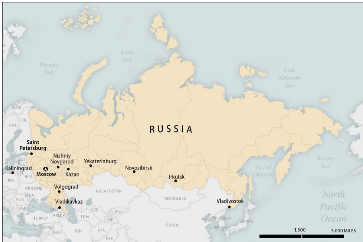
Figure 1. Map of Russia

Sources: Graphic produced by the Congressional Research Service (CRS). Map information generated by Hannah Fischer using data from the Department of State (2015) and Esri, a geographic data company (2014).