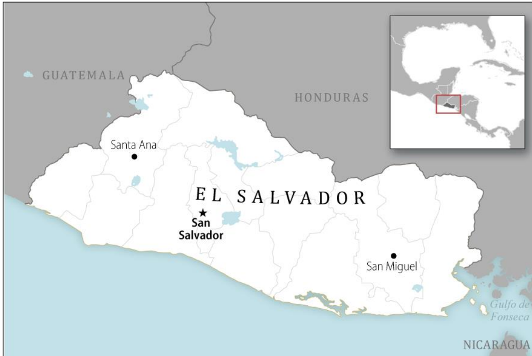
Figure 1. Map of El Salvador and Key Data on the Country

The attorney general’s office has brought cases against the two most recent ARENA presidents. Francisco Flores (1999-2004) passed away in January 2016 while awaiting trial for allegedly embezzling donations from Taiwan destined for earthquake relief. In August 2018, former president Anthony (“Tony”) Saca (2004-2009) pled guilty to charges of money laundering and embezzlement of some $300 million. Saca is now serving a 10-year prison sentence. 6