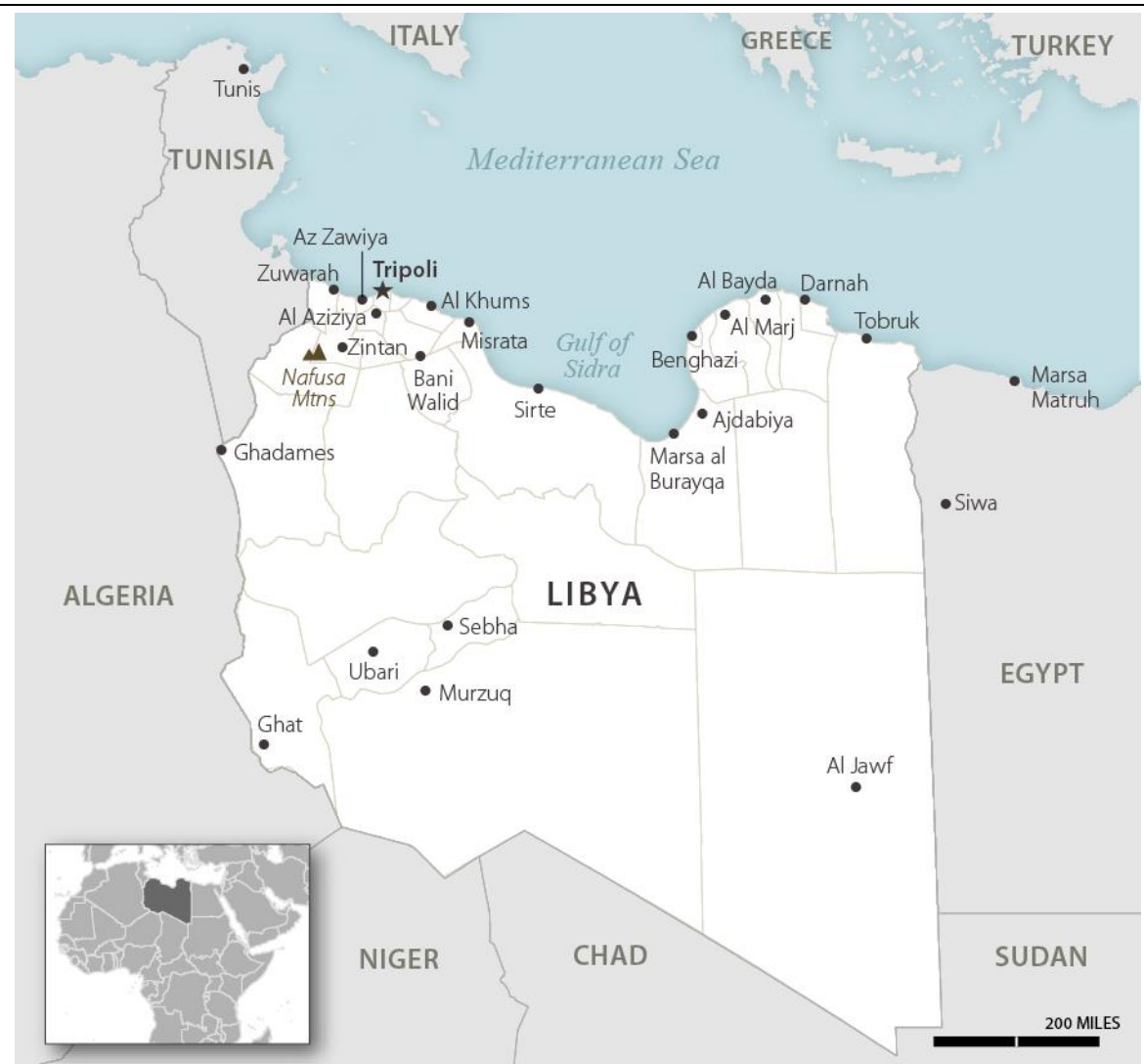
Table I. Libya Map and Facts

Land Area: 1.76 million sq. km. (slightly larger than Alaska); Boundaries: 4,348 km (~40% more than U.S.-Mexico border); Coastline: 1,770 km (more than 30% longer than California coast)