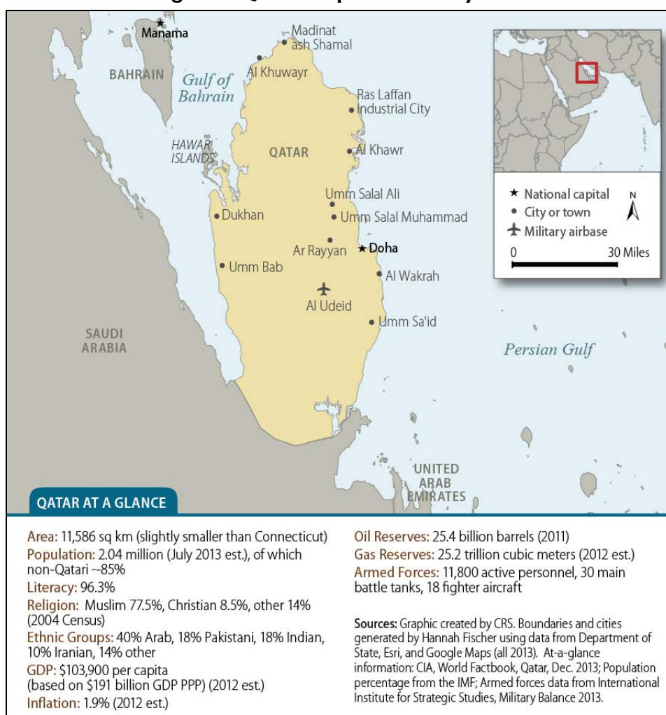
Figure 1. Qatar: Map and Country Data

Qatar, a small peninsular state bordering Saudi Arabia in the Persian Gulf (see Figure 1 ), declared its independence on September 3, 1971. 1 It is a constitutional monarchy governed by the Al Thani family, and the constitution reflects the previously contested principle that successors to the throne will follow the hereditary line of the emir's male offspring. The Emir of Qatar, Tamim bin Hamad bin Khalifa Al Thani, began his rule in June 2013 when his father, Shaykh Hamad bin Khalifah, abdicated, marking the first voluntary and planned transition of power in Qatar since its independence. Shaykh Hamad raised the global profile and influence of the small, energy-rich country after replacing his own father in a palace coup in 1995. Emir Tamim's mother, Shaykha Mohza, is active in leading education, health, and women's initiatives.