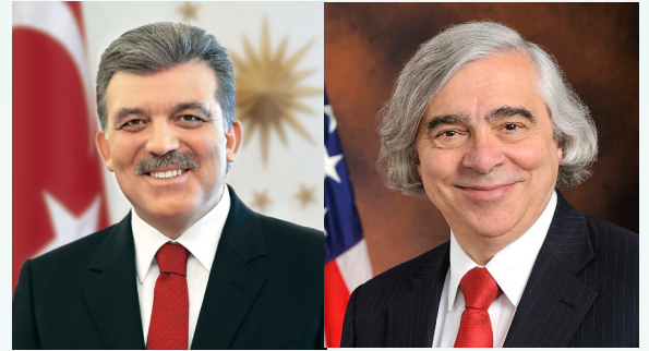
2013 keynote speakers included Turkish President Abdullah Gül and US Secretary of Energy Ernest Moniz .

Now in its sixth year, the Atlantic Council Energy and Economic Summit in Istanbul brings together a unique and preeminent community of global leaders for a lively two-day debate on business opportunities, values, energy development, and political challenges in a region standing at the crossroads of history. Held in the newest global city, the Summit analyzes the latest in political and business trends, as well as promotes opportunities in a region spanning from Central Asia in the East to Central Europe to the Levant in the West.