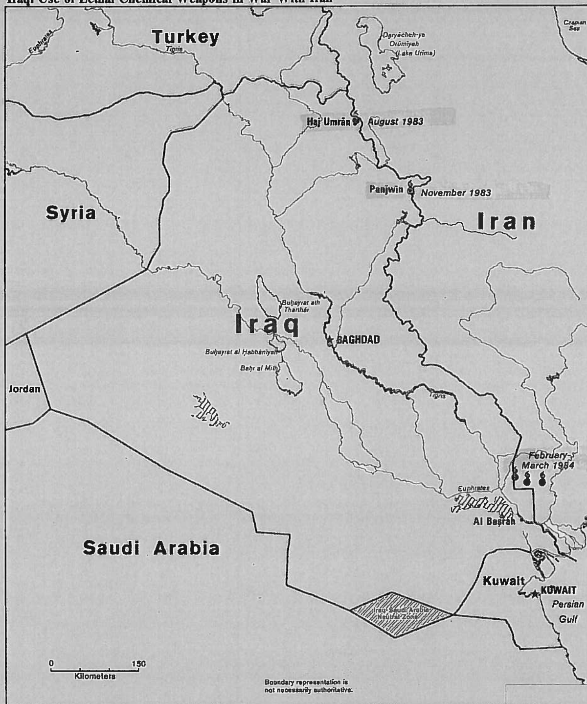
Figure 4 Iraqi Use of Lethal Chemical Weapons in War With Iran